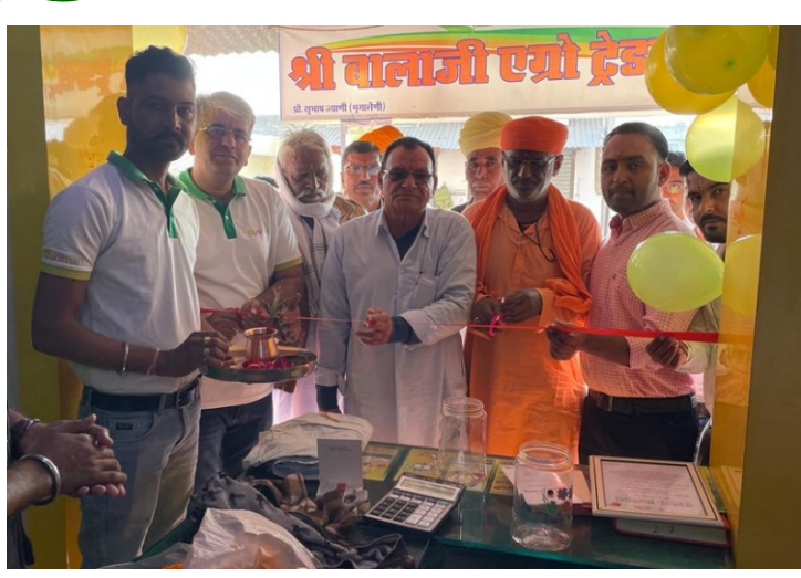
Shree balaji agro traders, Unimart outlet launched at Edwa, Nagaur, Rajasthan on 4 December, ,2022. . approximately 200 farmers attended the Inauguration.