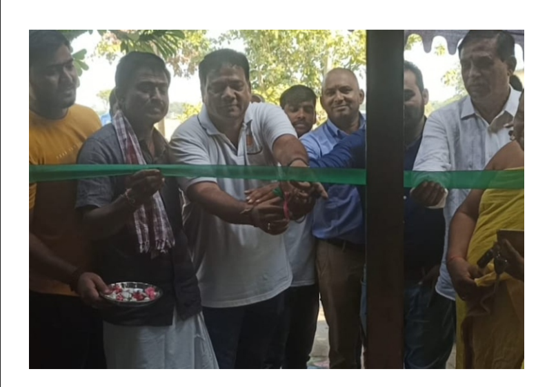
Varalaxmi Fertilisers Pesticides and Seeds ,Unimart outlet launched at Kannnur, Hanamkonda, Telangana on 15 December ,2022. approximately 40 farmers attended the inauguration.