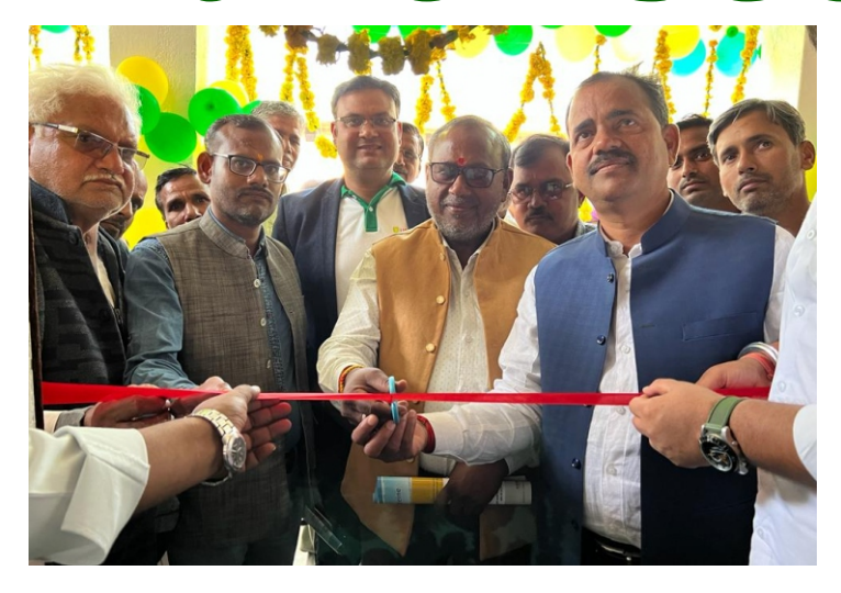
National Hardware ,Unimart outlet launched at Kanauj,Uttar Pradesh on 3 December, 2022.approximately 100 farmers attended the Inauguration.