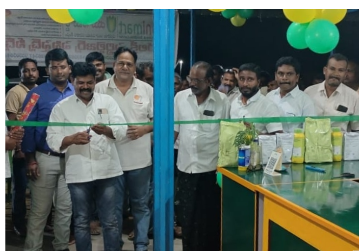
Varalaxmi Fertilisers Pesticdes seeds and general stores, Unimart outlet launched at E Bayyaram mandal, Bhadradri Kothagudem, Telangana on 28 December 2022. approximately 50 farmers attended the inauguration.