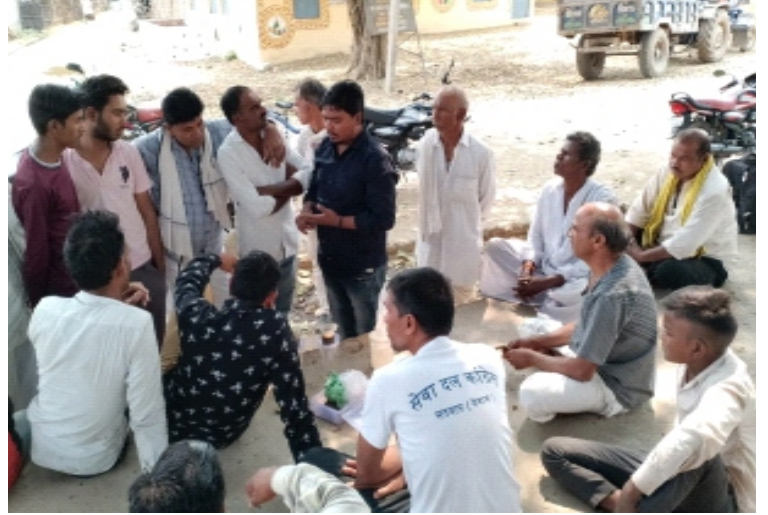
On Field Training & Zeba Demonstrations by Extension Officer at satwas ,Madhya Pradesh on 3rd March 2023.