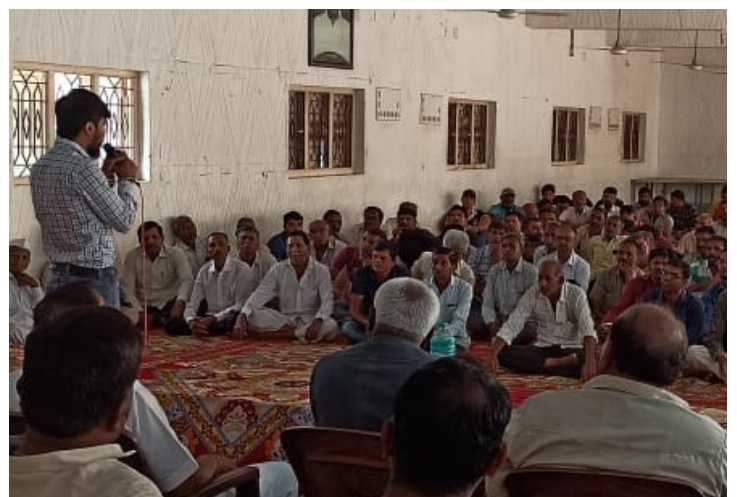
Unimart outlet AvaniKalp FPC launched at Jamkandorna, Gujarat on 4th March, 2022. around 200 farmers attended the Inauguration Ceremony.