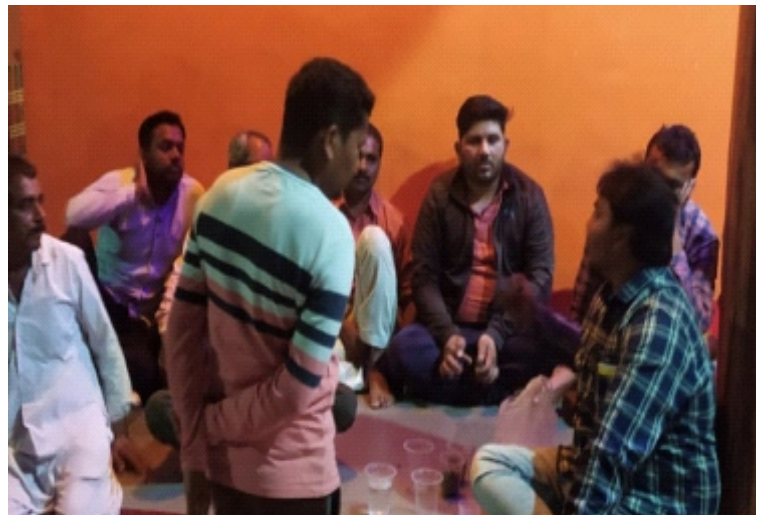
Night farmers meeting for Zeba Demonstration at Narshingpur, Madhya Pradesh on 5th March 2023.