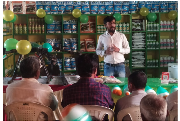
Unimart outlet Kisan Agro launched at Kodinar, Gujarat on 18th February ,2023. around 100 farmers attended the Inauguration Ceremony.