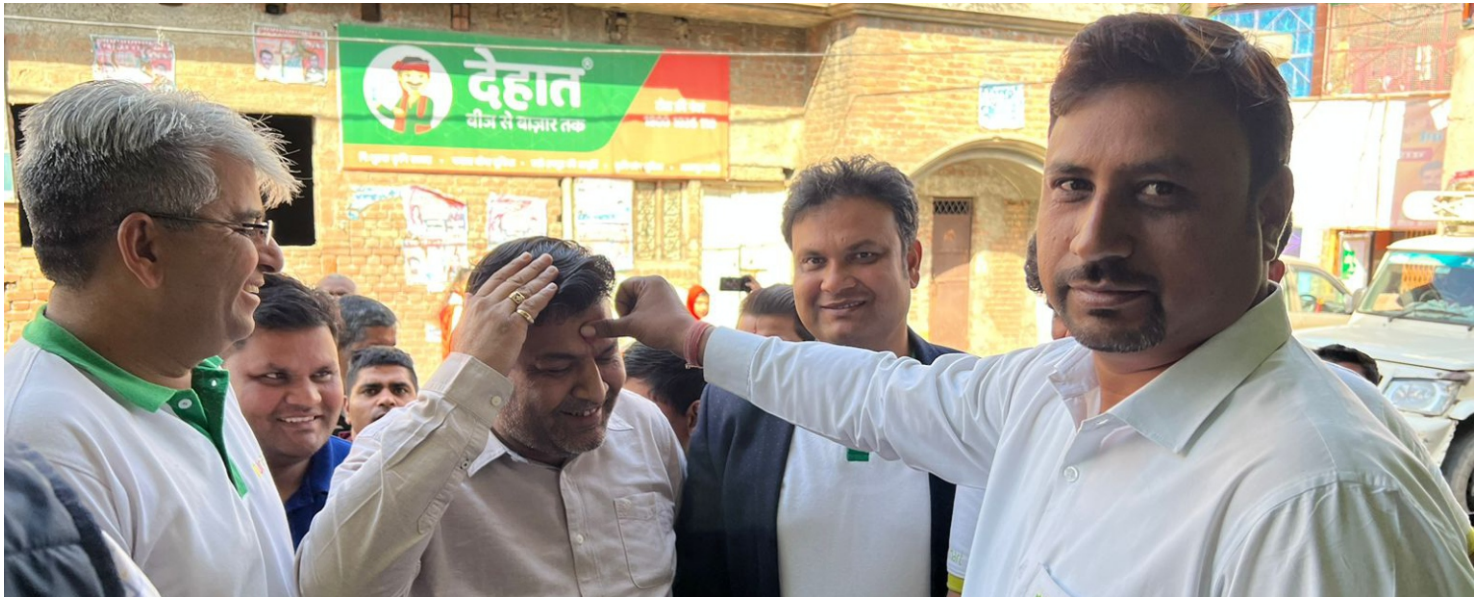
Unimart outlet launched at Dhanora, Amroha on 13th February,2023. Approx 100 farmers attended the Inauguration Ceremony..